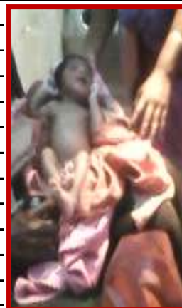
EMT safely transported both mother and Newborn to the